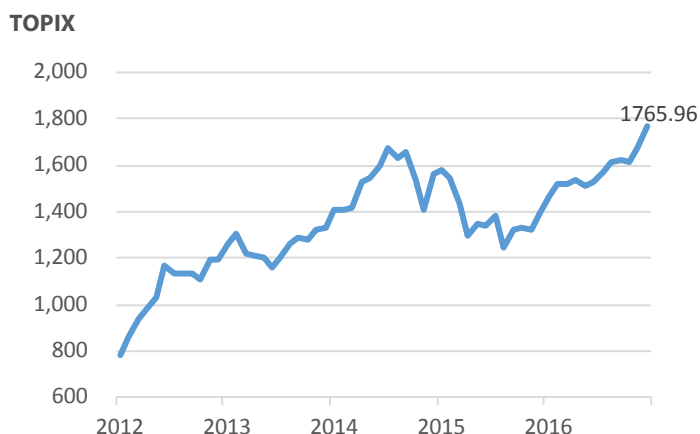
Exhibit 3: Major Market Indices