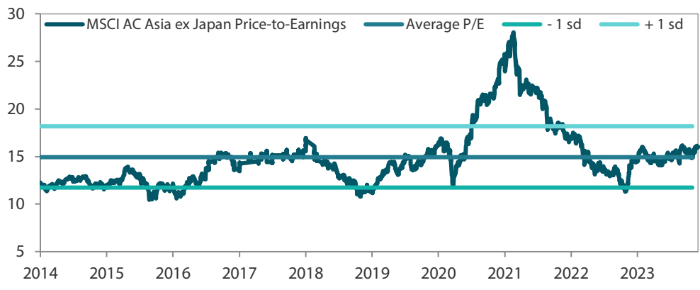
Chart 4: MSCI AC Asia ex Japan price-to-earnings

Ratios are computed in USD. The horizontal lines represent the average (the middle line) and one standard deviation on either side of this average for the period shown. Past performance is not necessarily indicative of future performance.