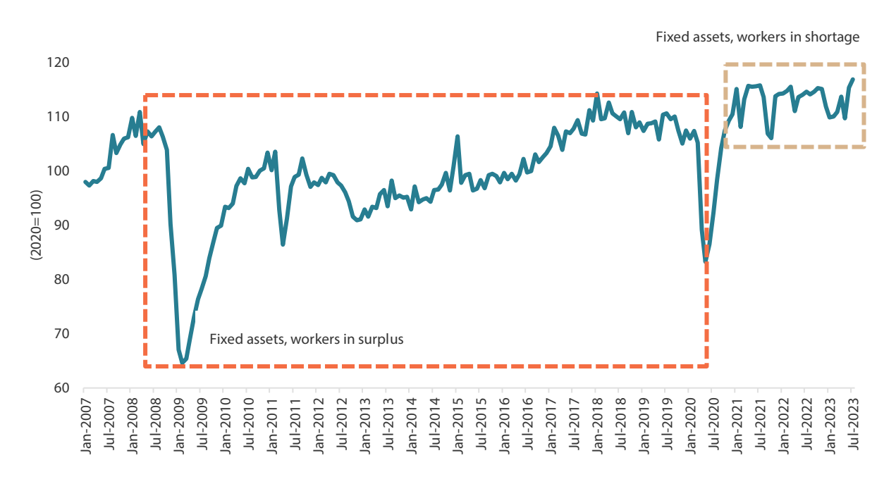
Chart 1: Japan's real exports (January 2007-July 2023)