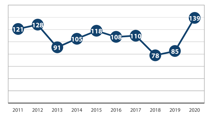
Chart 3: Number of divestitures in Japan (January-June)