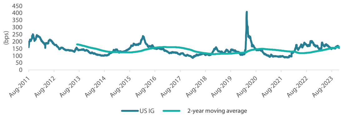
Chart 4: US Investment grade credit spreads