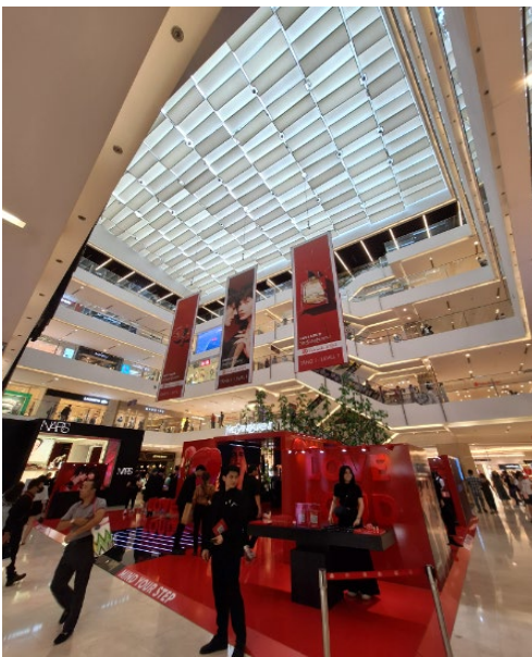
Figure 1: Busy atrium in a downtown mall in Ho Chi Minh City